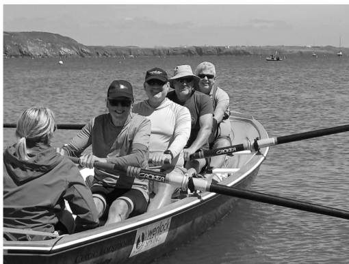
The Dale Boat in the Cleddau Marathon rowing race on June 13th